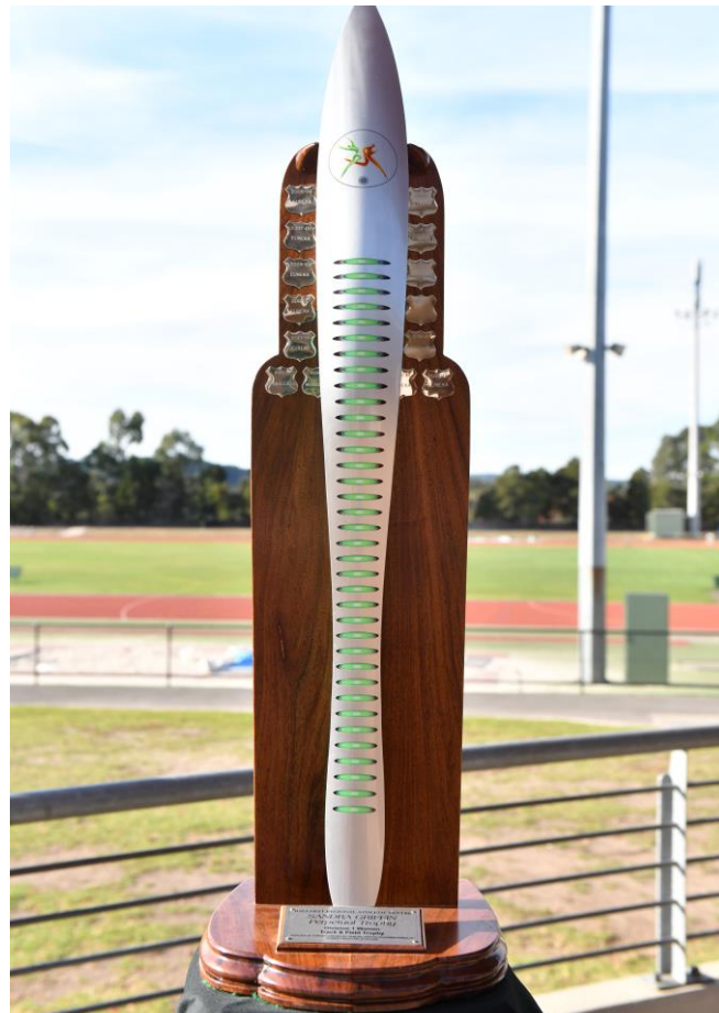
Sandra Griffin trophy - OPEN Women's Trophy