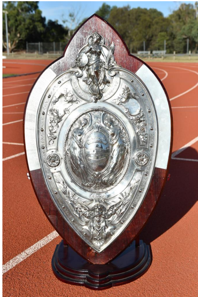
W. Loughlin Shield - OPEN Men's Trophy